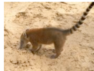
Unknown species to us....

Smiles like these are what make each trip worth it and a blessing!