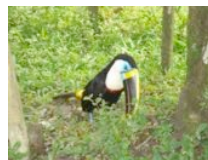
Our Toucan "IVAN"